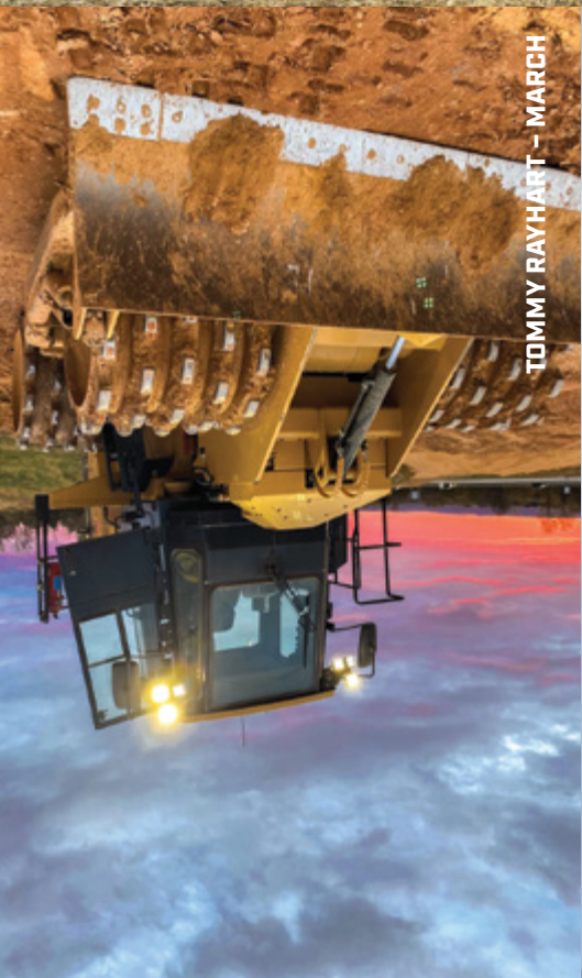
TOMMY RAYHART - MARCH